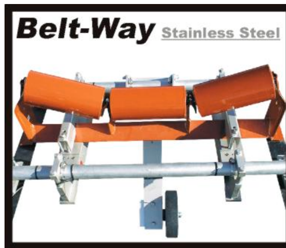
Low, Medium, and High Capacity Models Available