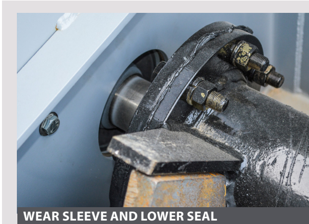
WEAR SLEEVE AND LOWER SEAL