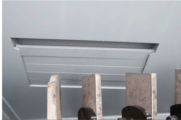
ADJUSTABLE OVERFLOW GATE