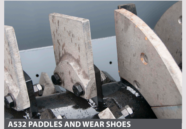
A532 PADDLES AND WEAR SHOES