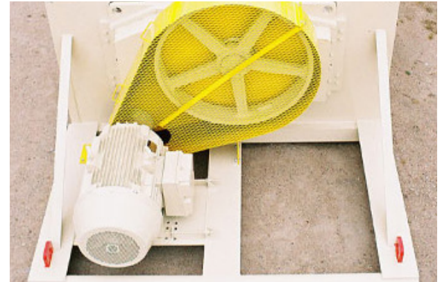
GUARDED DRIVE SYSTEM