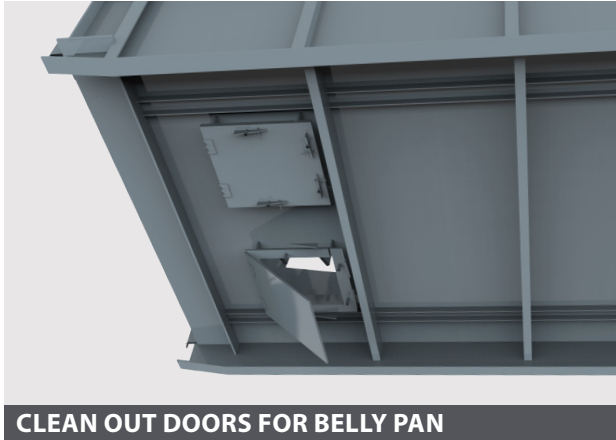
CLEAN OUT DOORS FOR BELLY PAN