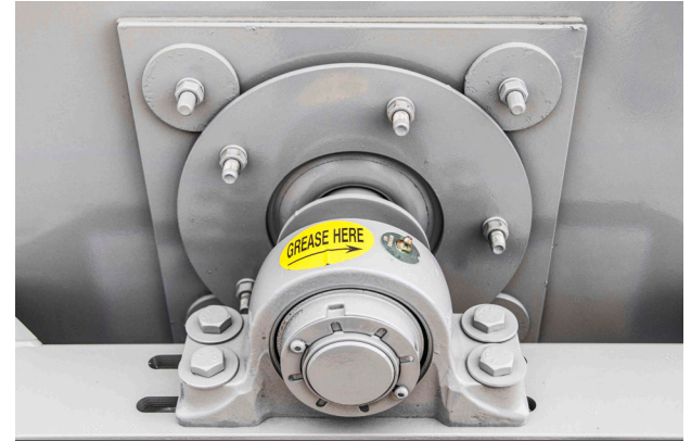
SLINGER PROTECTS LOWER BEARING