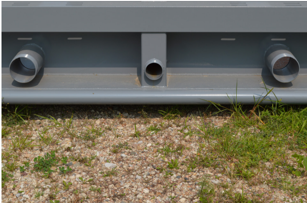
EASY ACCESS TO DRAIN AND FILL