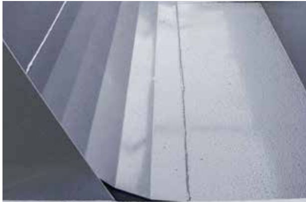
CURVED BELLY PAN