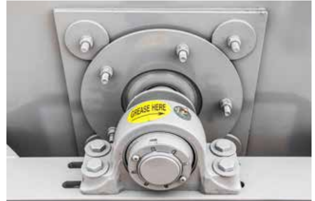
SLINGER PROTECTS LOWER BEARING