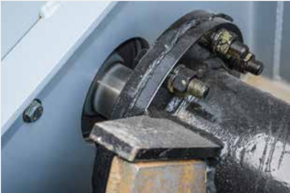
WEAR SLEEVE AND LOWER SEAL