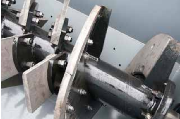
A532 WEAR SHOES AND PADDLES