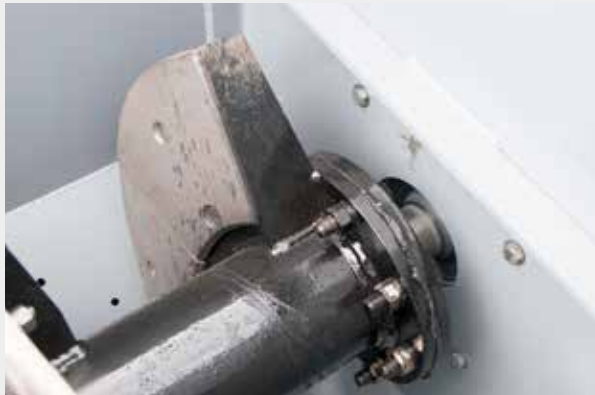
SHAFT AND WEAR SHOES