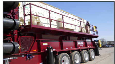
Wide Flange Beam Chassis