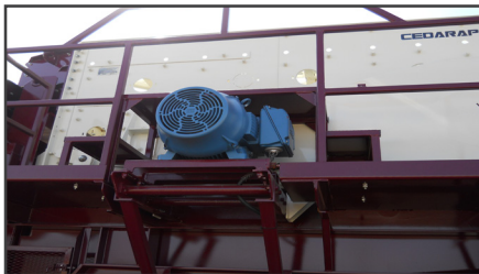
40 hp WEG Screen Motors

*NOTE: Listed weights are not exact. Actual weights will vary based on screen size, brand, options, etc.*