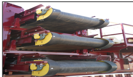
Reversible 42" Cross Conveyors