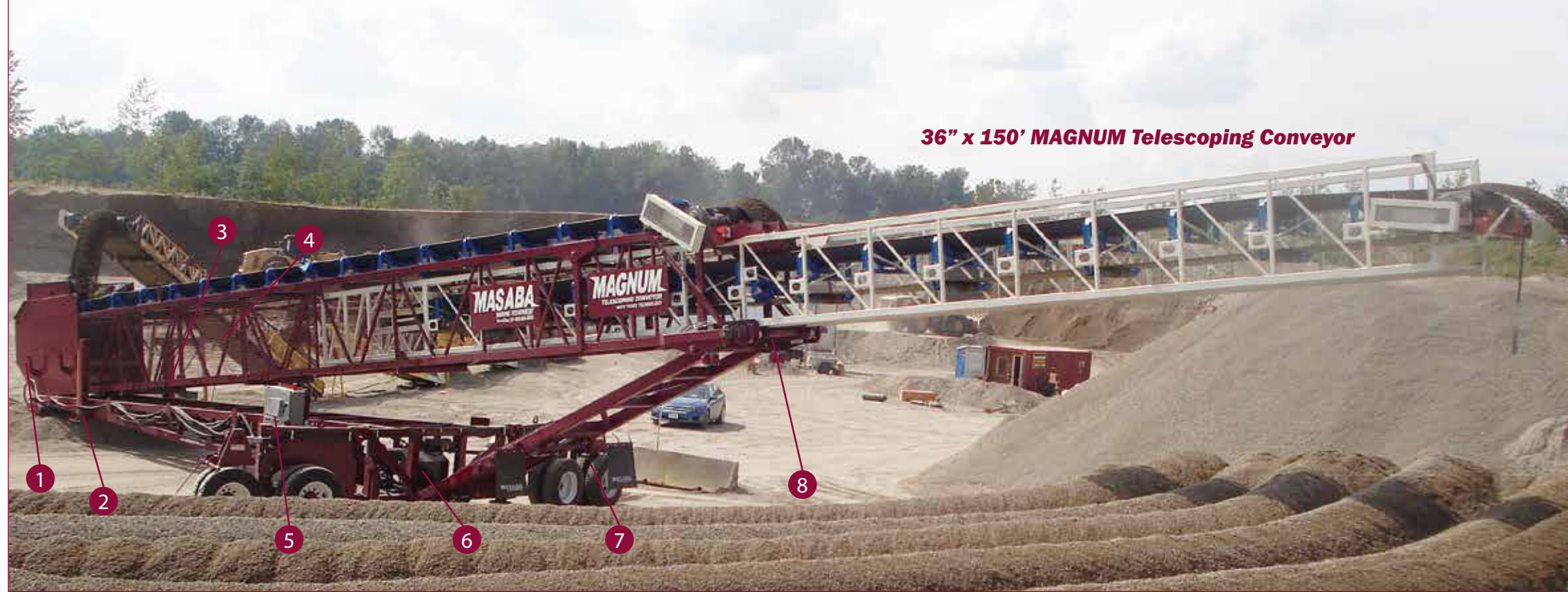
36" x 150' MAGNUM Telescoping Conveyor