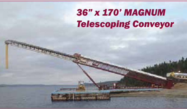
36" x 170' MAGNUM Telescoping Conveyor

5 Year Complete Structural 2 Year Complete Equipment WARRANTY