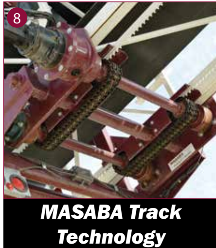
MASABA Track Technology